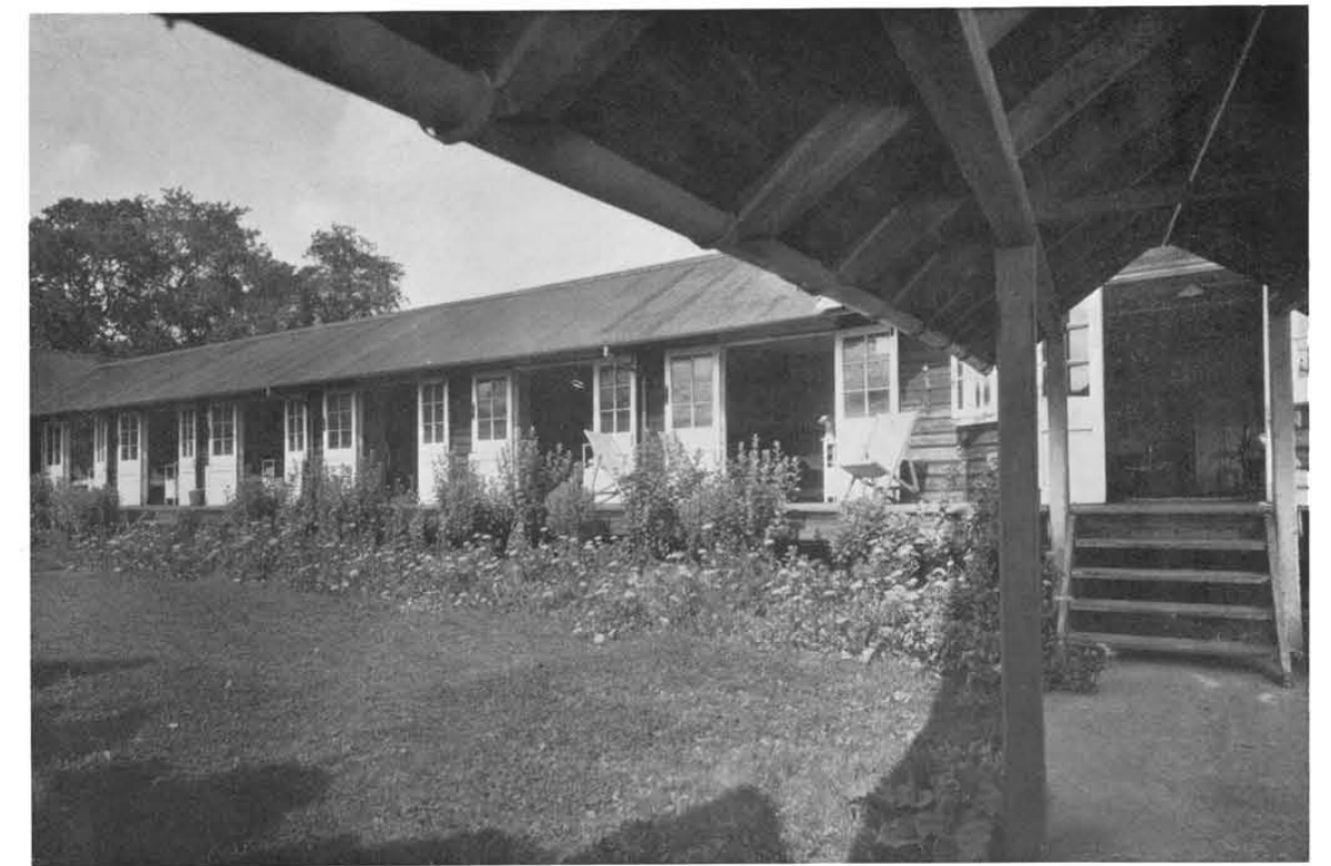
Malting's Farm Sanatorium.

Social amenities obtain where advisable, and the Sanatorium has its own chapel and chaplain. Al-